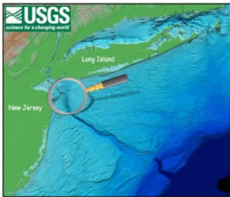
Figure 2. Bathymetry of the coastal ocean in the New York-New Jersey metropolitan region. The sandy, relatively shallow mid-Atlantic continental shelf is bisected by the Hudson Shelf valley, a submerged river valley containing muddy sediments that may act as a conduit for cross-shelf transfer of sediments.