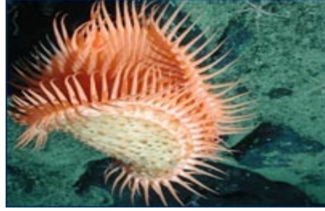
Venus Fly Trap Anemone (Hormathiidae)

Aesthetic Qualities: Hundreds of high-quality photographs, maps and video of Davidson Seamount's unique creatures including fishes, corals, and invertebrates as well as the seamount's remarkable topography are available via NOAA websites, visitor centers, CD products, newspaper articles, television broadcasts and presentations.