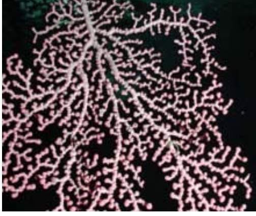
Bubblegum coral (Paragorgia sp.)

Inclusion of Davidson Seamount was raised during public scoping meetings held in the fall/winter of 2002-2003 to gather early input on potential revisions to the MBNMS management plan. The MBNMS Advisory Council agreed that Davidson Seamount should be evaluated further as part of the management plan review process.