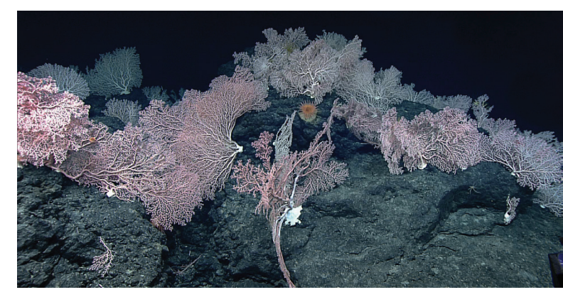
A dense pink coral garden was found at nearly 1,800 meters (5,905 feet) on Mendellsohn Seamount. Many of the colonies were exceptionally large.