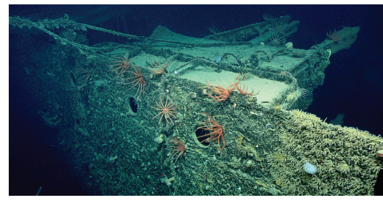
ROV Deep Discoverer (D2) exploring the USS Baltimore.